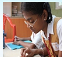
Special Children IDEC