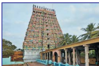
Kumbeshwarar Temple - Kumbakonam 2 hr 16 min (90.9 km)