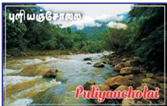
Puliyancholai - Trichy Dist. 1 hr 30 min (62.1 km)