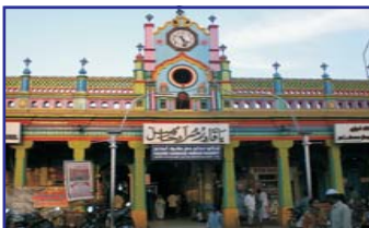
Nagoor Dhargha 3 hr 27 min (154.5 km)