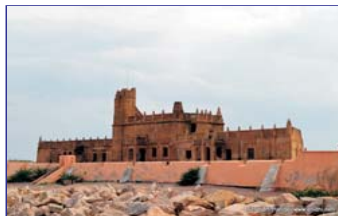
Danish Fort - Tharagambadi 3 hr 46 min (203.4 km)