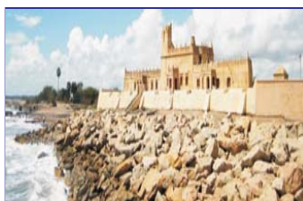
Poombukar 3 hr 34 min (193.3 km)