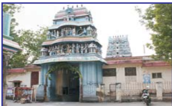
Vayalur Murugan Temple 45 min (23.2 km)