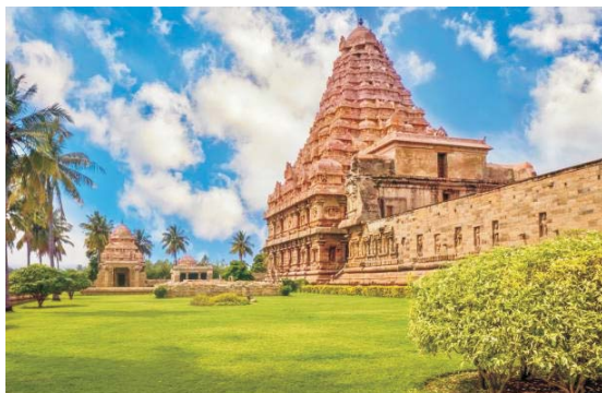
Gangaikonda Sholapuram - Ariyalur Dist. 2 hr 12 min (99.1 km)