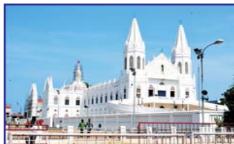
Velankanni Church 3 hr 31 min (157.9 km)