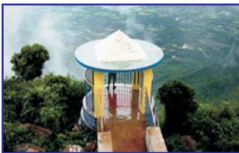
Kolli Hills - Namakkal Dist. 3 hr 32 min (120.7 km)